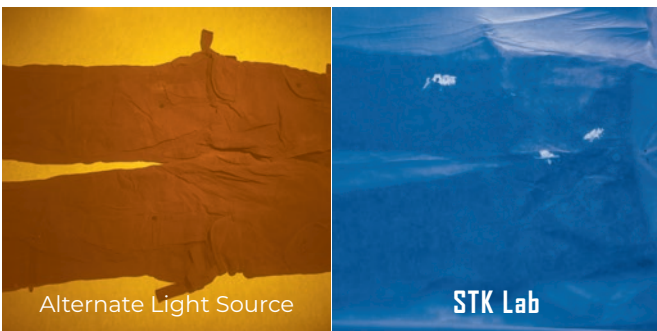
Alternate Light Source

After years of research in collaboration with the French National Institute of Scientific Police (INPS/LPS69) and ICBMS (UMR5246), AXO Science is now bringing to the forensic experts STK Lab (INPI DSO 2017000128).